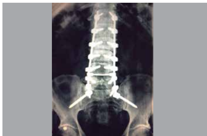
Figure 4. Postoperative view of long instrumentation with iliac fixation. Radiograph in AP Iliac screws connected directly to the rods.