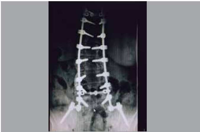
Figure 6. Postoperative – Long instrumentation with iliac screws connected to the rods through lateral connectors. Bone mass showing posterolateral fusion.