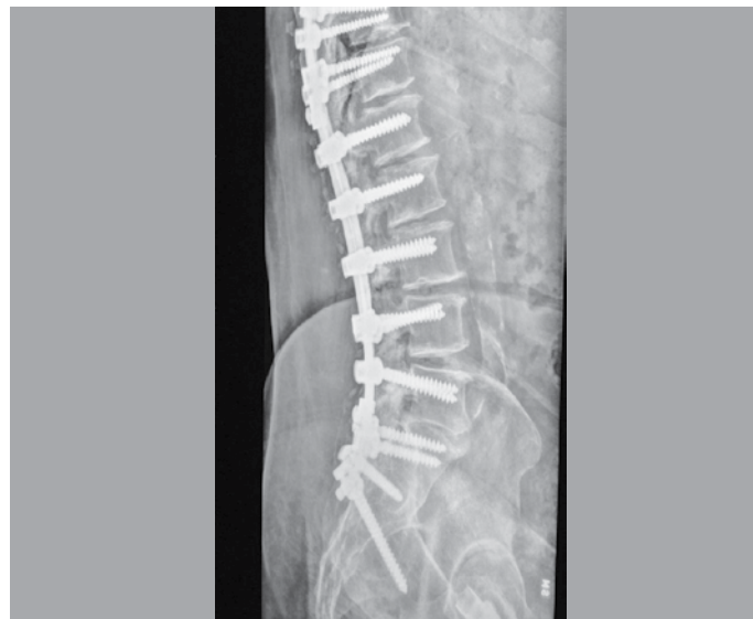
Figure 3. Postoperative view of long instrumentation with iliac fixation. Lateral radiograph.