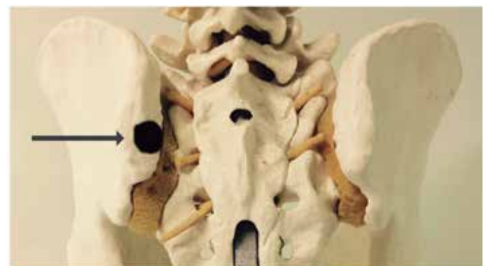
Figure 1. Model of the hip showing the point of entry of the screw in the posterior view.