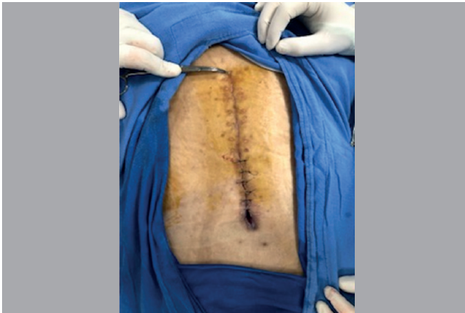
Figure 3. 14 days following closure of the wound, the sutures are removed and the final segment is closed.