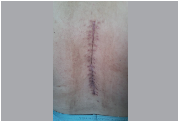
Figure 4. Removal of stitches 5 weeks following initial intervention with NPWT. Complete wound closure.

the patient and for every level of the healthcare team.