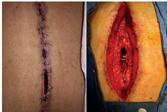
Figure 1. Male patient with dehiscence of the surgical wound after instrumentation for a fracture of L2.

By performing initial wound closure, following cleansing, selective debridement, and the placement of strips of foam dressing impregnated with silver between the muscle fascia and the subcutaneous cell tissue, reduced pressure on the skin is achieved, favoring