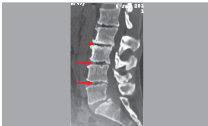
Figure 2. Sagittal section of the Multi Slice Tomography showing vacuum phenomenon in the first 4 lumbar discs.